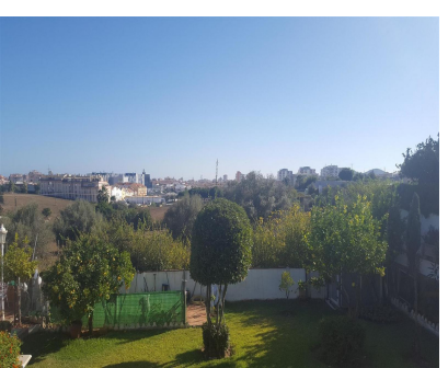
Mijas Costa Ref.-ID: MIBGR3036125