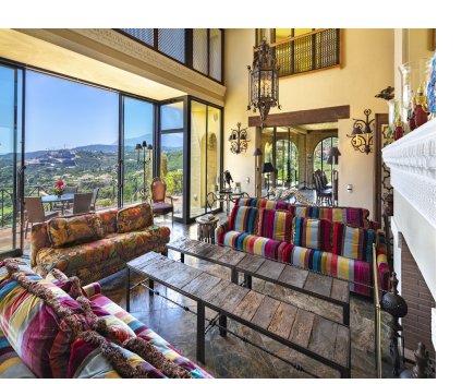
Ref.-ID: MIBGR3805369 Benahavís House

Community: 3,312 EUR / year IBI: 4,941 EUR / year