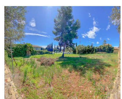
a (po mou