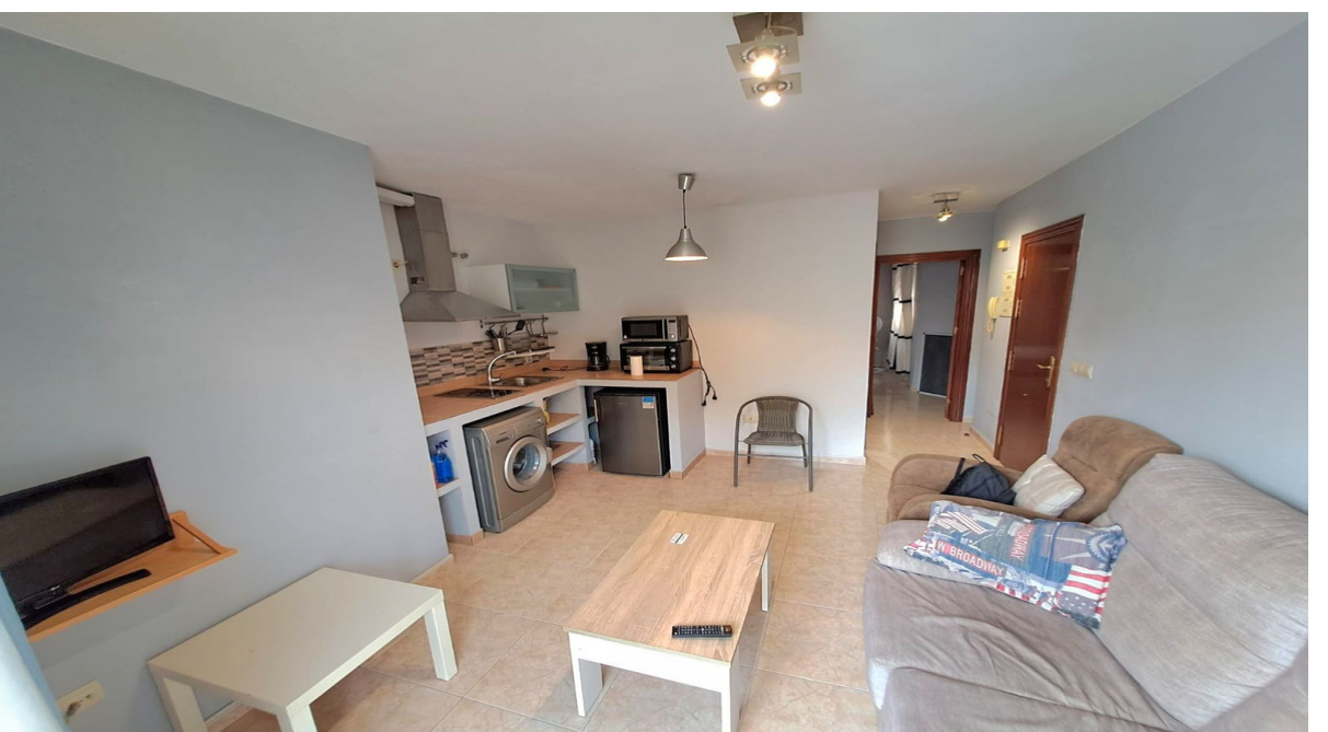
Ref.-ID: MIBGR4196827 Fuengirola Apartment