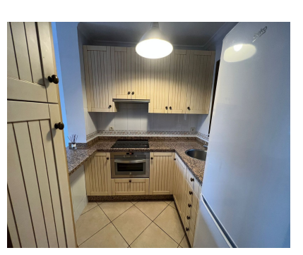
Ref.-ID: MIBGR4197409 Mijas Golf House