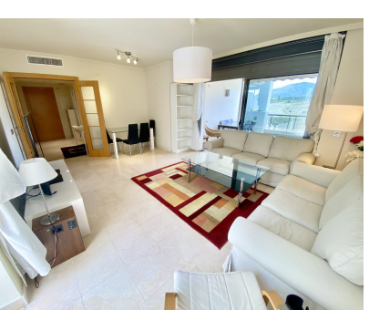
Benahavís Apartment Ref.-ID: MIBGR4309492