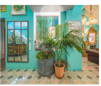
Ref.-ID: MIBGR4383583 The Golden Mile House

Community: 4,812 EUR / year IBI: 3,089 EUR / year