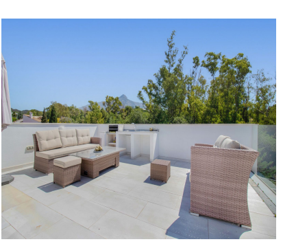
Ref.-ID: MIBGR4404076 Marbella House

Community: 7,440 EUR / year IBI: 1,708 EUR / year