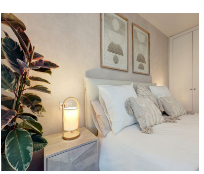
Ref.-ID: MIBGR4624858 B