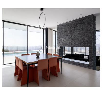
Ref.-ID: MIBGR4643515 Valtocado House