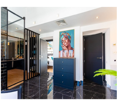
Ref.-ID: MIBGR4700032 Puerto Banús Apartment