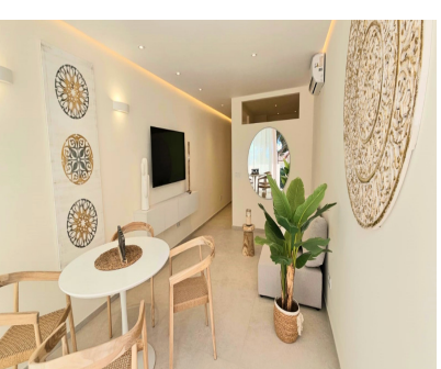
Ref.-ID: MIBGR4700218 Estepona Apartment