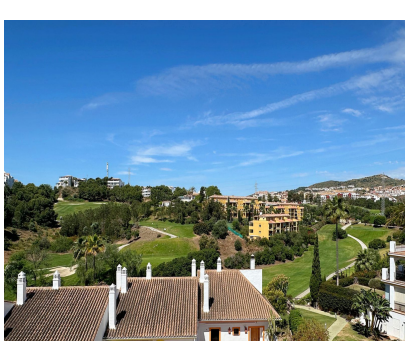
Ref.-ID: MIBGR4721866 Miraflores House

Community: 5,460 EUR / year IBI: 135 EUR / year