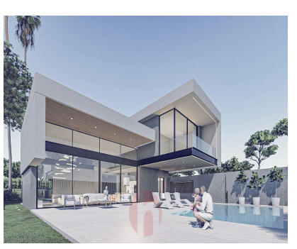
Ref.-ID: MIBGR4727779 Marbella Plot