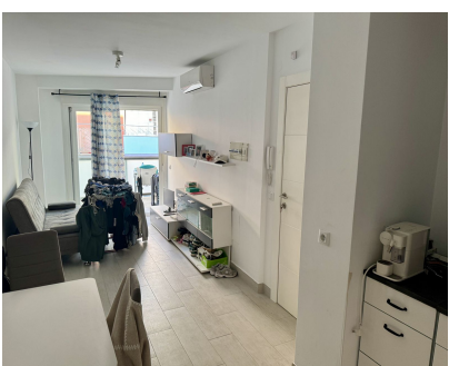
Ref.-ID: MIBGR4730245 Fuengirola Apartment