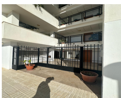
Ref.-ID: MIBGR4747861 Benalmadena Costa