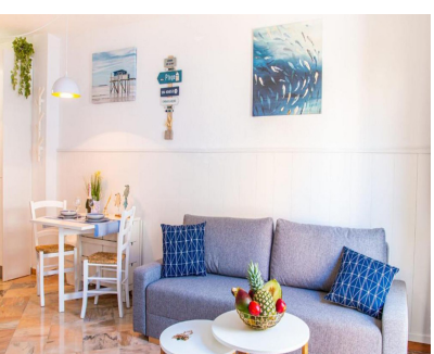
Ref.-ID: MIBGR4752745 Elviria