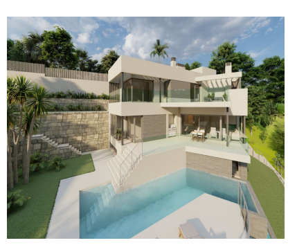
Ref.-ID: MIBGR4763659 Mijas Plot