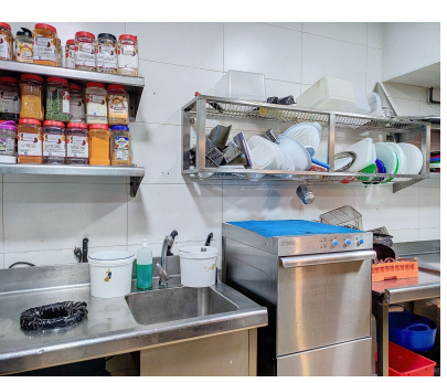
Ref.-ID: MIBGR4793392 Torremolinos Commercial