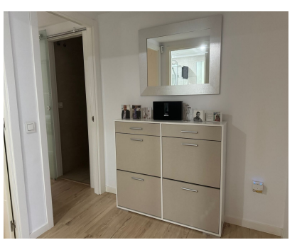
Ref.-ID: MIBGR4793803 Mijas Costa Apartment