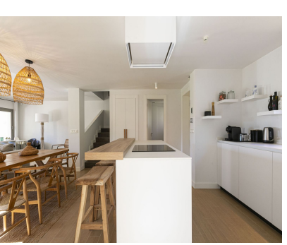
Ref.-ID: MIBGR4798546 Mijas House