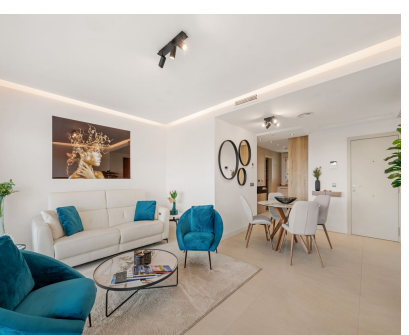
La Cala Golf Ref.-ID: MIBGR4801585