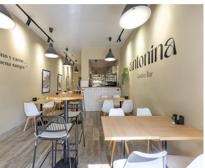
Ref.-ID: MIBGR4835884 Marbella Commercial