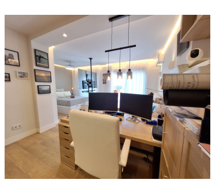
Ref.-ID: MIBGR4847785 Riviera del Sol