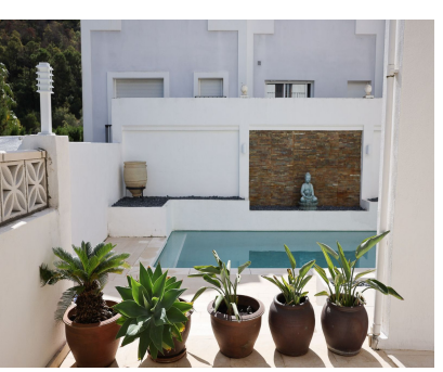
Ref.-ID: MIBGR4855330 Benahavís