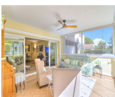
Ref.-ID: MIBGR4862494 Bahía de Marbella

Community: 1,896 EUR / year IBI: 1,132 EUR / year Rubbish: 184 EUR / year