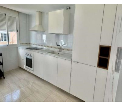
Ref.-ID: MIBGR4904392 Fuengirola Apartment