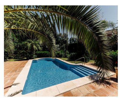
Ref.-ID: MIBGR4907305 Bahía de Marbella House

Community: 1,560 EUR / year IBI: 3,000 EUR / year