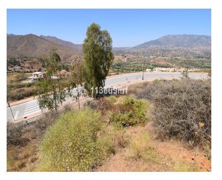
Plot Ref.-ID: MIBGR2971553 La Cala Golf