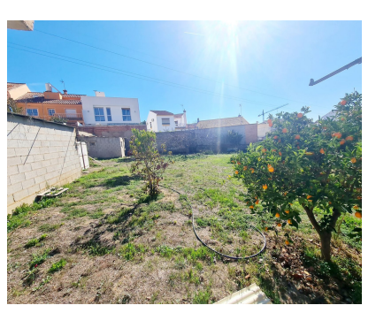
Ref.-ID: MIBGR3254710 Los Pacos Plot