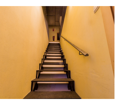
Ref.-ID: MIBGR3378064 Estepona

IBI: 459 EUR / year Rubbish: 87 EUR / year