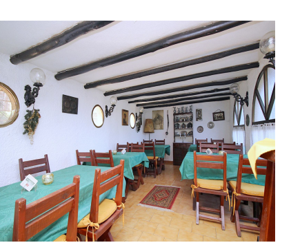
Ref.-ID: MIBGR4068490 Marbesa