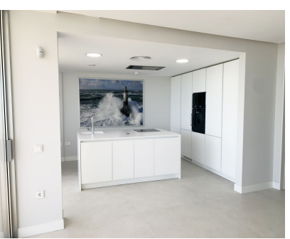
Ref.-ID: MIBGR4167619 Estepona Apartment