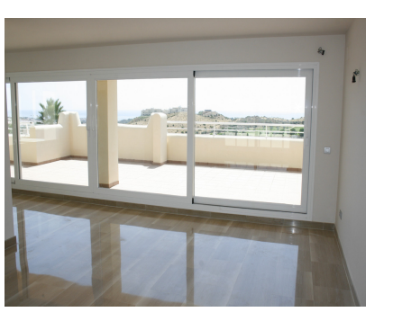
Ref.-ID: MIBGR4229536 Mijas Costa

Community: 6,384 EUR / year IBI: 1,088 EUR / year