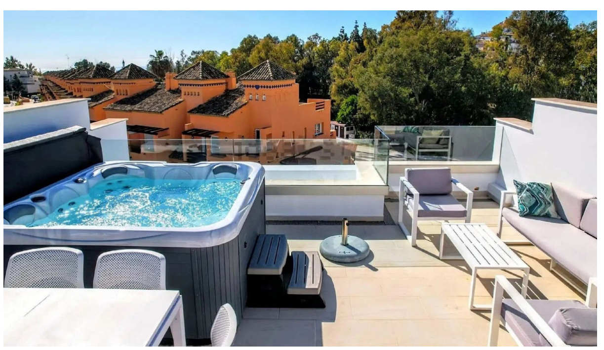
The Golden Mile