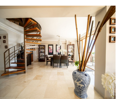
Ref.-ID: MIBGR4292473 Fuengirola

Community: 2,028 EUR / year IBI: 689 EUR / year