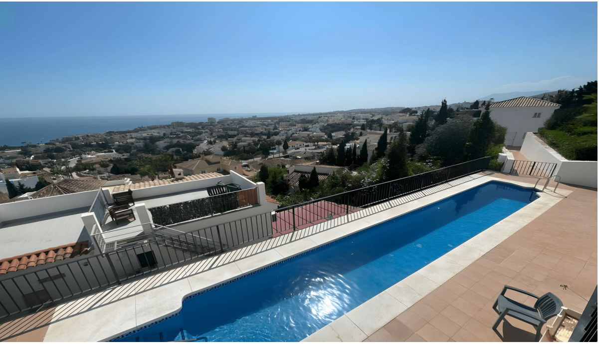
Riviera del Sol

IBI: 400 EUR / year Rubbish: 80 EUR / year