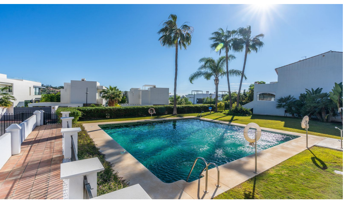
New Golden Mile