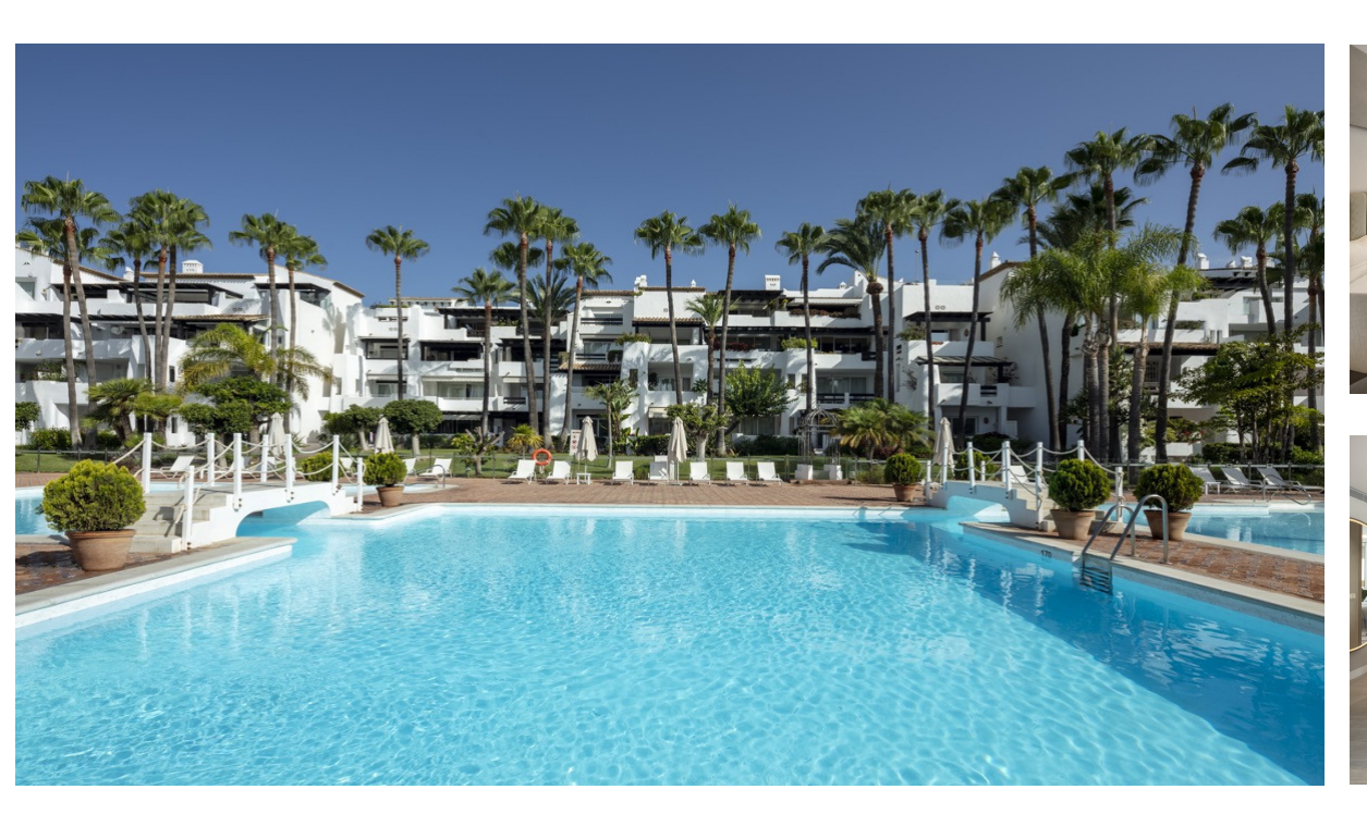
The Golden Mile