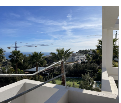
Ref.-ID: MIBGR4647043 Mijas House

Community: 1,020 EUR / year IBI: 1,000 EUR / year