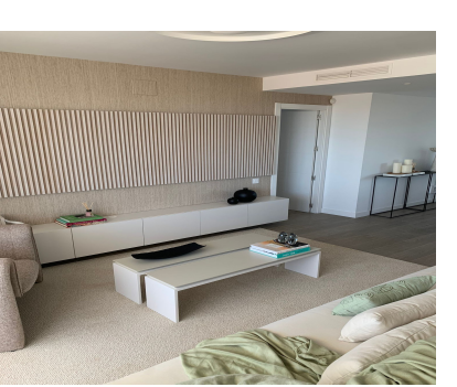
Ref.-ID: MIBGR4659676 La Cala de Mijas

Community: 1,320 EUR / year IBI: 800 EUR / year