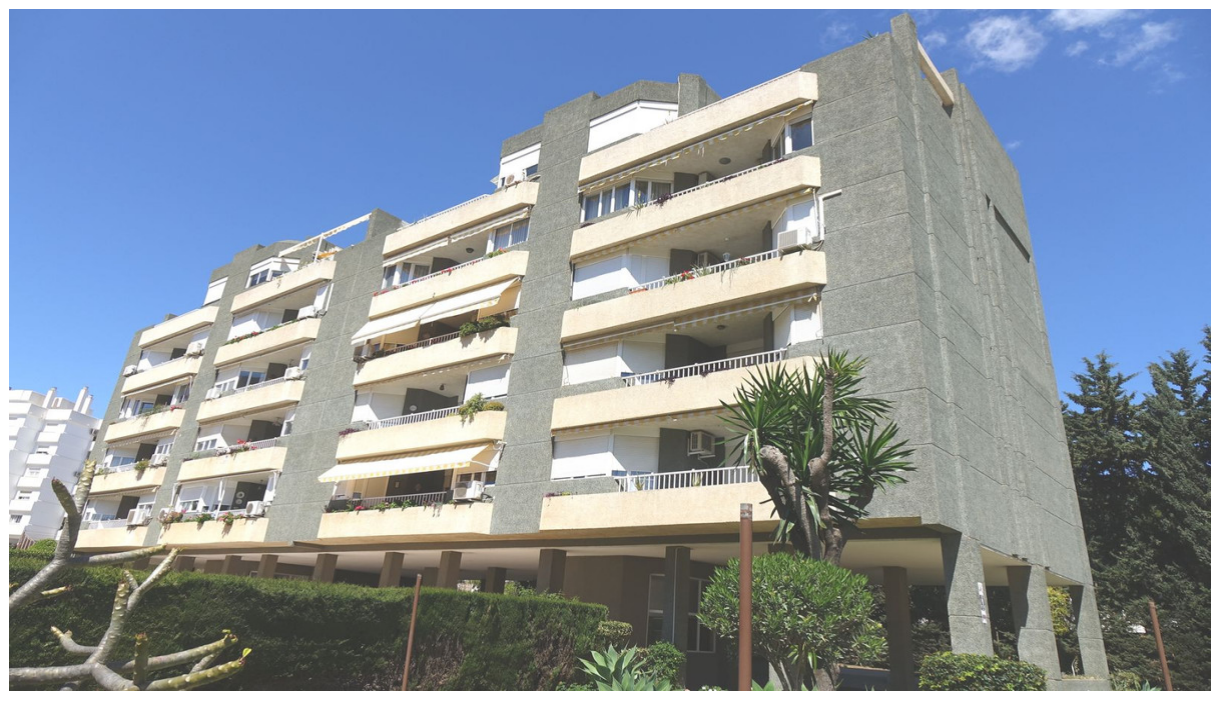
Arroyo de la Miel