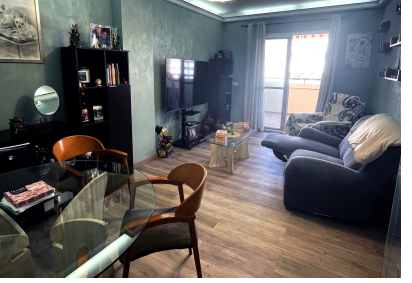
Community: 1,080 EUR / year