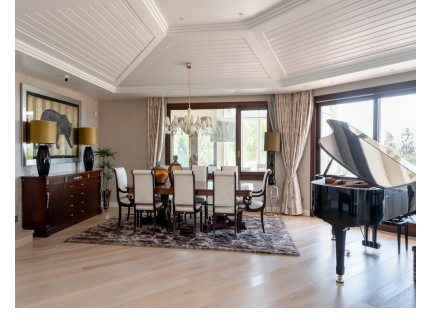
Ref.-ID: MIBGR4739728 Hacienda Las Chapas