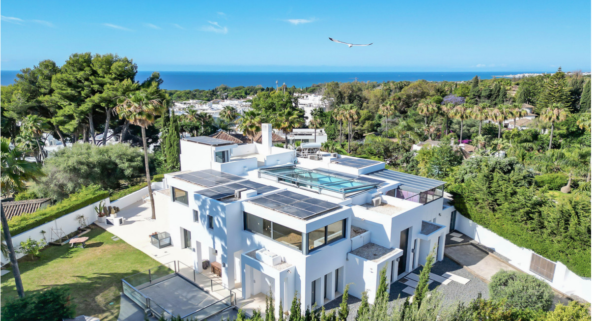
The Golden Mile