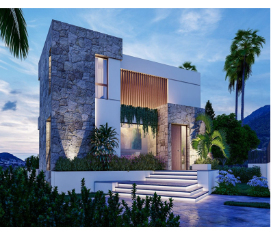
Ref.-ID: MIBGR4763410 Mijas Plot