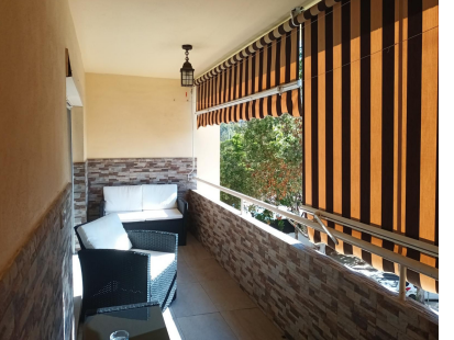
Community: 1,020 EUR / year