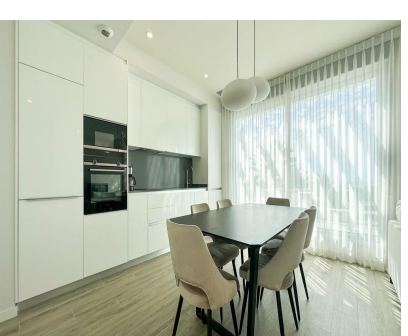
Ref.-ID: MIBGR4787326 New Golden Mile