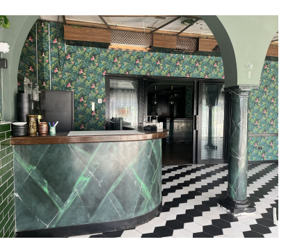
Ref.-ID: MIBGR4793293 Elviria Commercial