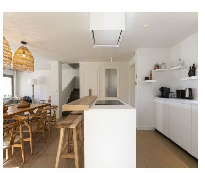
Ref.-ID: MIBGR4798546 Mijas House

Community: 1,980 EUR / year IBI: 1,780 EUR / year